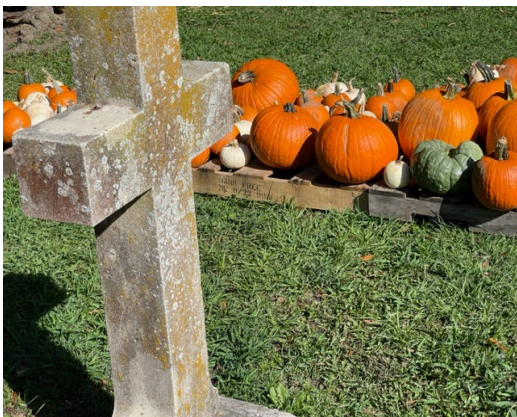
Beautiful site in our historic church yard.