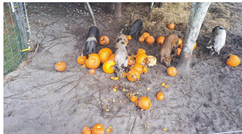
Rotting pumpkins are a special treat for the farmer’s pigs.