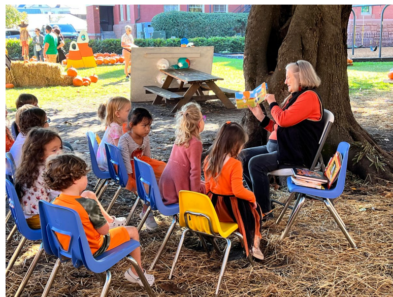
Preschool story time at the Pumpkin Patch