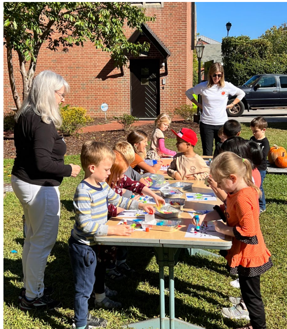
Crafting with preschool visitors.