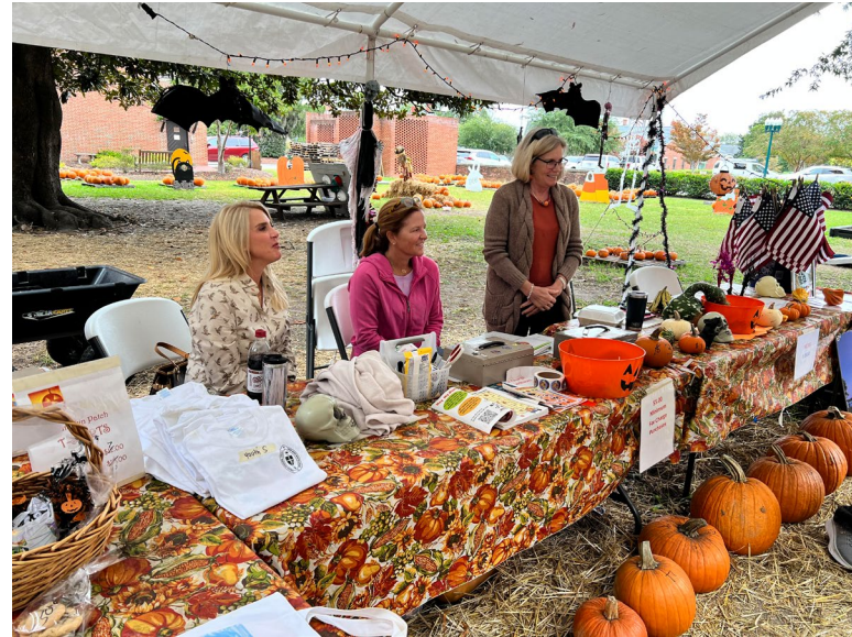
Hard at work selling those pumpkins, gourds, and mums!

And now for the exciting part — the final tally! Christ Church’s proceeds from this year’s Pumpkin Patch amounted to a record-breaking $8,441.63, which is nearly a 37 percent increase over 2022. All of these funds will be returned to local charities via our Christ Church Trust/ Outreach Grants. In addition, the remaining two-thirds of our gross proceeds are returned to the New Mexico Navaho reservation — a true win/win outcome. Thank you again to all those who supported the 2024 Pumpkin Patch.