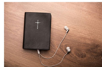
Hearing God's Call

In appreciation of your commitment to the 2025 Pledge Campaign, please pick up a magnet from the basket at the Reception Desk. We appreciate you "Hearing God's Call."